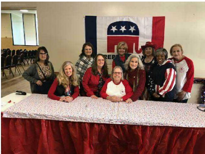
A momentous day to be a part of RWGC at the Gregg County Republican Convention.