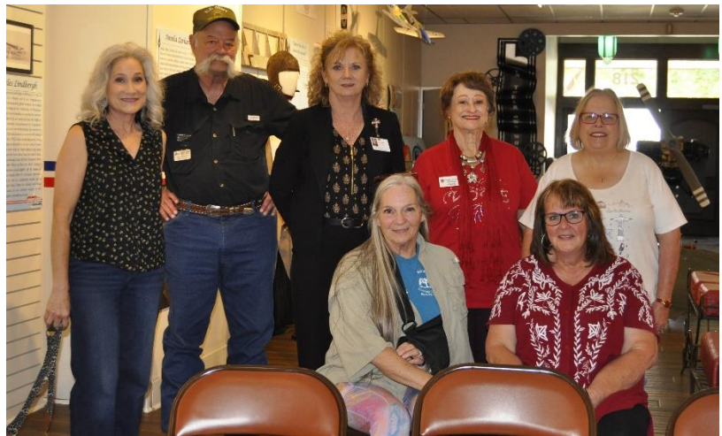
“Girls on the Go” visit the Gregg County Historical Museum