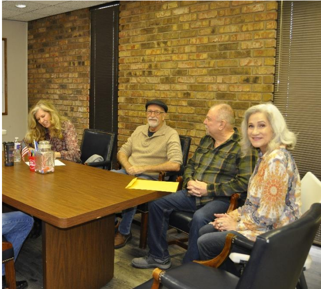
Precinct Convention at the Longview GOP