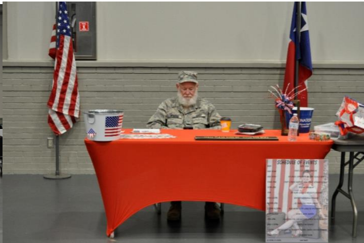
Veterans Appreciation Event 2023