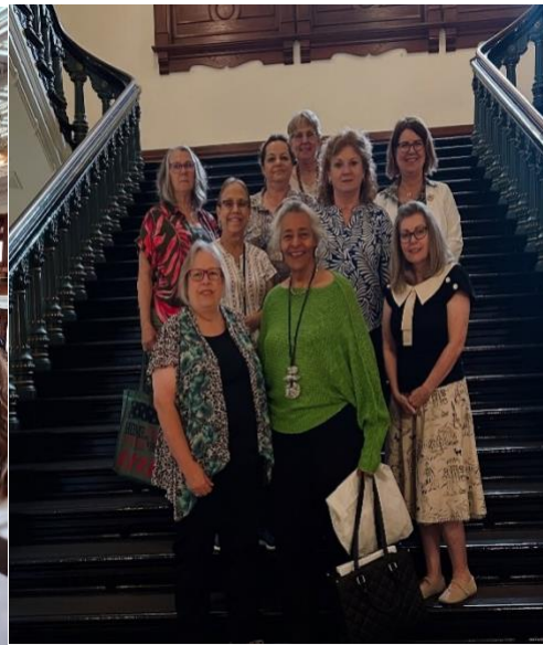
Many members speaking their voice on health care, veterans, and small business owner issues at the State Capital