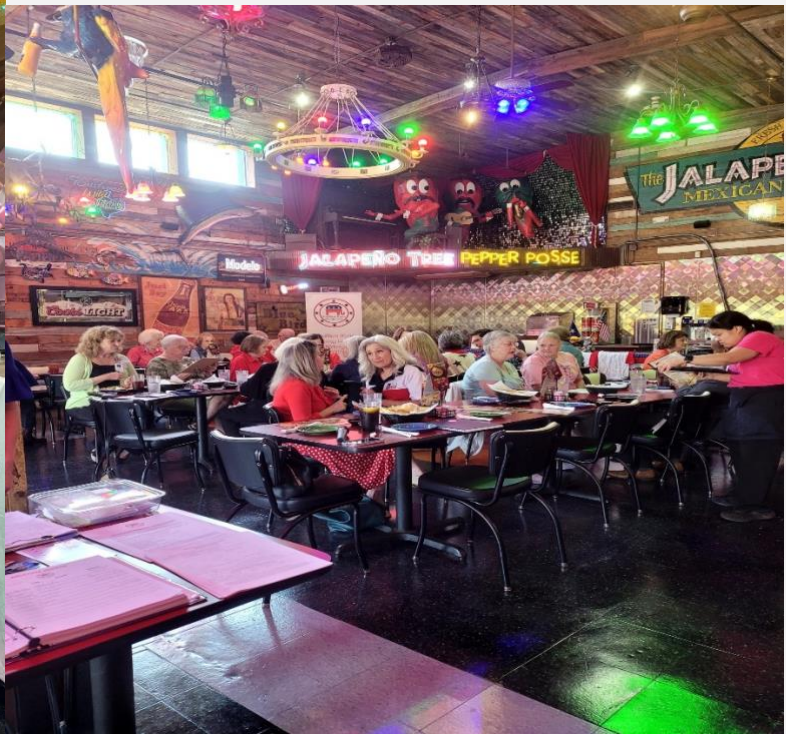
April General Mtg to hear State of the County Address