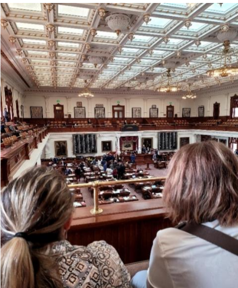
Members watching the Texas House Legislature